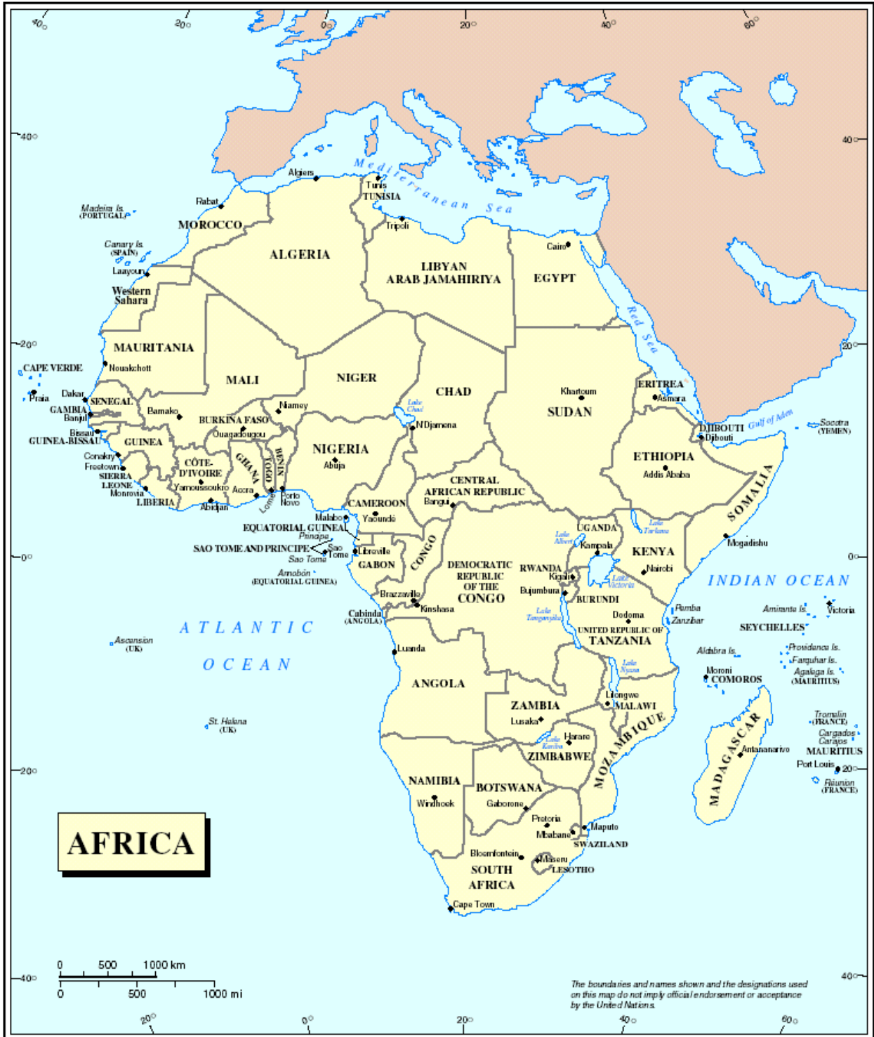
Map 1. Map of Africa showing independent states (including Cameroon and Nigeria)