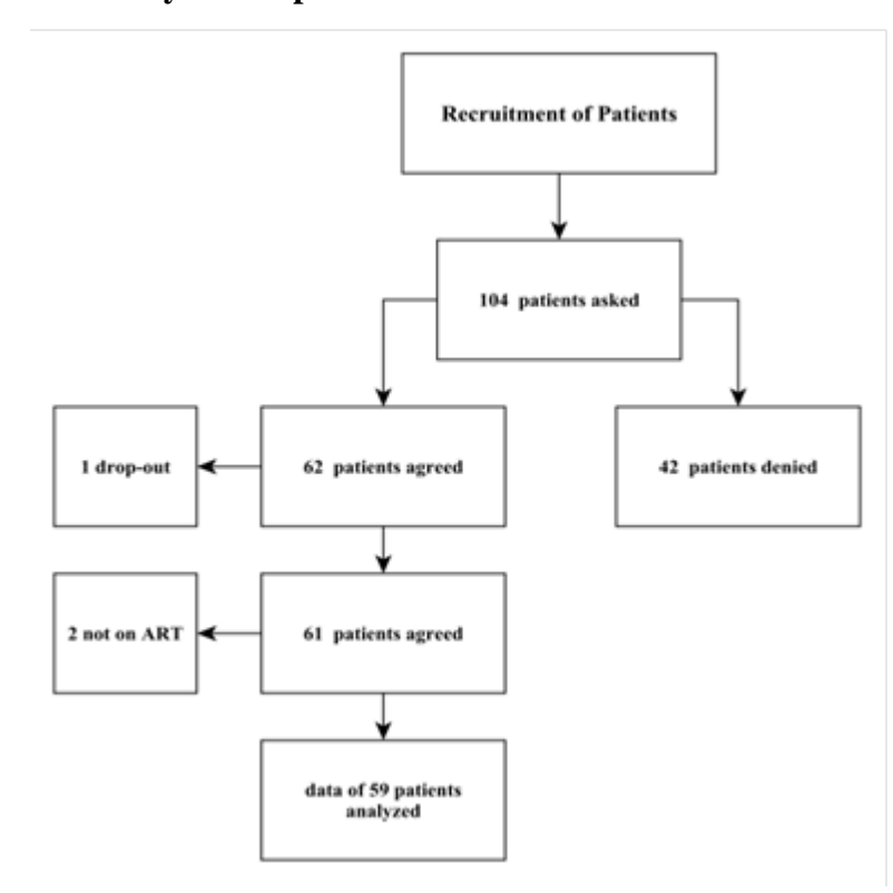
Figure 4: Recruitment of patients

Exclusively female patients were recruited by the AMOs, fulfilling the recruitment rules of being over 18 years of age, registered at the CTC, tested positive for HIV the earliest at the last visit of the CTC, being in a stable health condition to undergo the interview and prior to study commencement having provided written or finger-ink printed consent. A total of 104 female women were asked for participation which 62 of (59.6%) agreed. With one