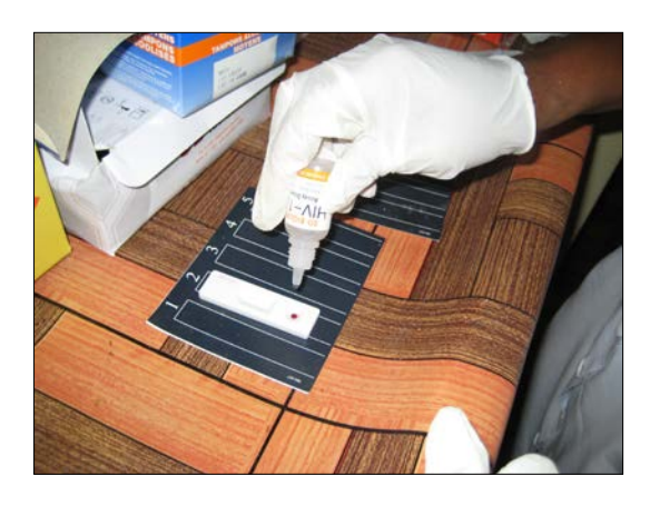
Figure 2: An HIV rapid test conducted by the nurse at the VCTC at Bombo Regional Hospital (LFB, 2008)