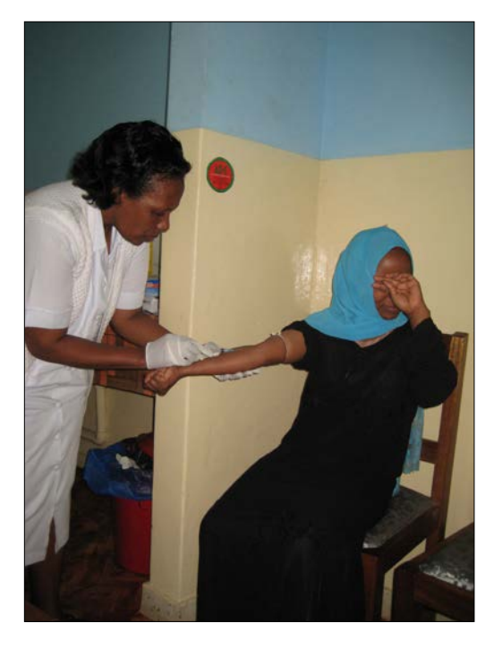
Figure 3: A young woman being tested for HIV at the VCTC at Bombo Regional Hospital (LFB, 2008)

The Care and Treatment Center located at the Bombo Regional Hospital (BRH) in Tanga, Tanzania, was chosen as research location. The BRH is the main and leading University affiliated hospital in Tanga Region, providing biomedical treatment to a population of more than 242,000 people in Tanga District alone (National Bureau of Statistics and Ministry of Planning, Economy and Empowerment 2006). The CTC, inaugurated in June 2006 and supported by several international and national stakeholders, served the needs of 6,300 registered HIV-seropositive patients in 2008, with the majority (69%) being female and more than half enrolled on antiretroviral treatment. Hence, the department was daily crowded with people, waiting for testing, medical check-ups, the commencement of ART, adherence classes or the prescription of further medication. At the time the department itself was incorporated into the hospital and included a Voluntary Counseling and Testing Center (VCTC), several offices for medical consultations, a laboratory, a pharmacy, as well as rooms for regular education sessions.