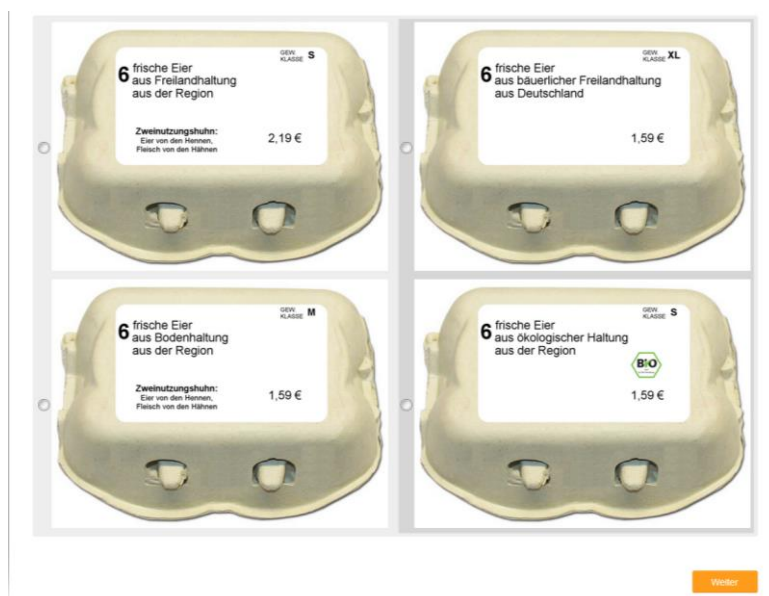
Figure 1: Example of a choice set (eggs)

Before the respondents answered the choice questions, a cheap talk script was presented to them which highlighted the importance of choosing the alternatives as realistically as possible, and trying to behave as if in a real shopping situation (Van Loo et al., 2014). The respondents were also provided with information about the products' attributes, which they could only click away from after a certain time. All the respondents were consumers of chicken meat and eggs, and so were familiar with these products. For this reason, we used a forced choice set without a no-choice option, because according to Parker & Schifft (2011), respondents use a more evaluative and attribute-based processing pattern when facing choice sets without the opt-out option.