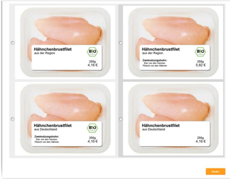
Figure 2: Example of a choice set (chicken breasts)